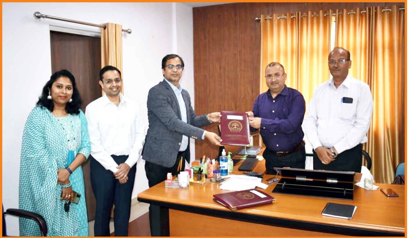
Signing of MoU between Khwaja Moinuddin Chishti Language University and HDFC BANK (Dated: 08 March, 2022)