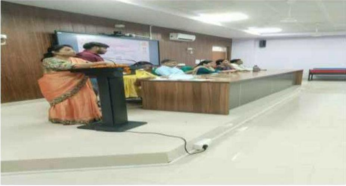
Speech on Women's Equality Day by a faculty member