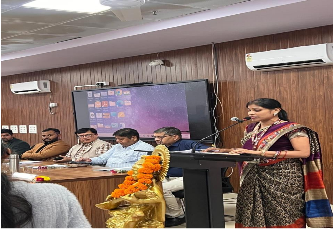
Workshop on Cyber Jagrukta Diwas