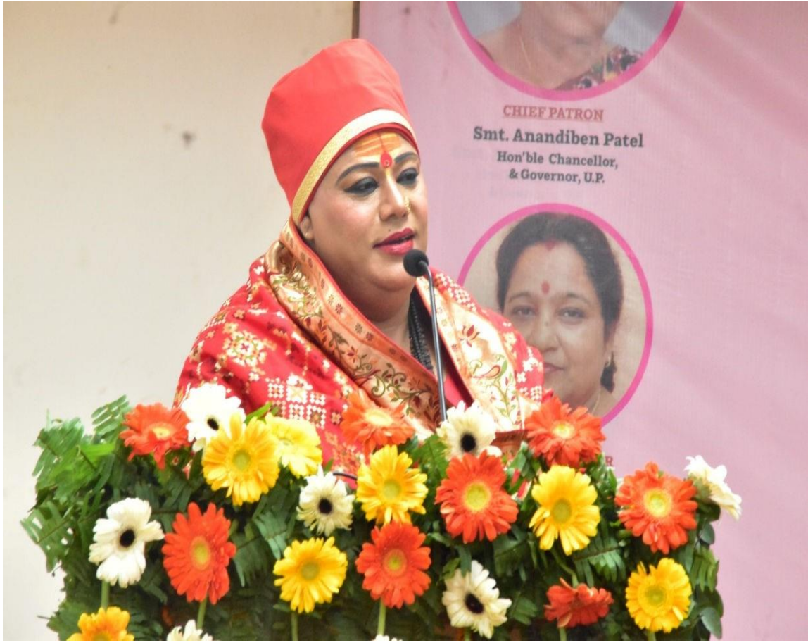
Glimpse of the Chief Guest sharing her views at the seminar