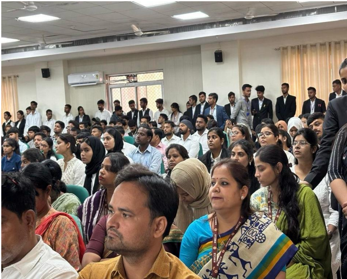
Glimpse of participants in the seminar

The seminar "From Law Graduate to Advocate: The Etiquettes" (विधि स्नातक से अधिवक्ता बनने की मर्यादाएँ), held on August 27, 2025, serves as a definitive training module for the ethical transition from academic study to professional practice. By inaugurating the Dr. B.R. Ambedkar Memorial Moot Court Hall alongside this discourse, the university emphasized that practical skill-building must be inseparable from moral character and professional "Mariyada" (decorum). The session provided critical guidance on the Ethics of Intellectual Labor , specifically training students to prioritize genuine library research and dedicated writing over an over-reliance on automated AI tools, thereby preserving cognitive integrity and the authenticity of legal drafting. By engaging undergraduate students, faculty, and senior advocates, the program institutionalized a culture of accountability where language is respected as a tool for justice and etiquette is viewed as a lifelong moral compass. Speakers, including His Excellency the Governor of Himachal Pradesh, emphasized that true professionalism stems from internalizing honesty and empathy rather than adhering to mere formalities. This initiative ensures that the university's legal community is not only technically proficient but also ethically anchored, preparing graduates to serve as high-integrity officers of the court who uphold the sanctity of the legal profession.