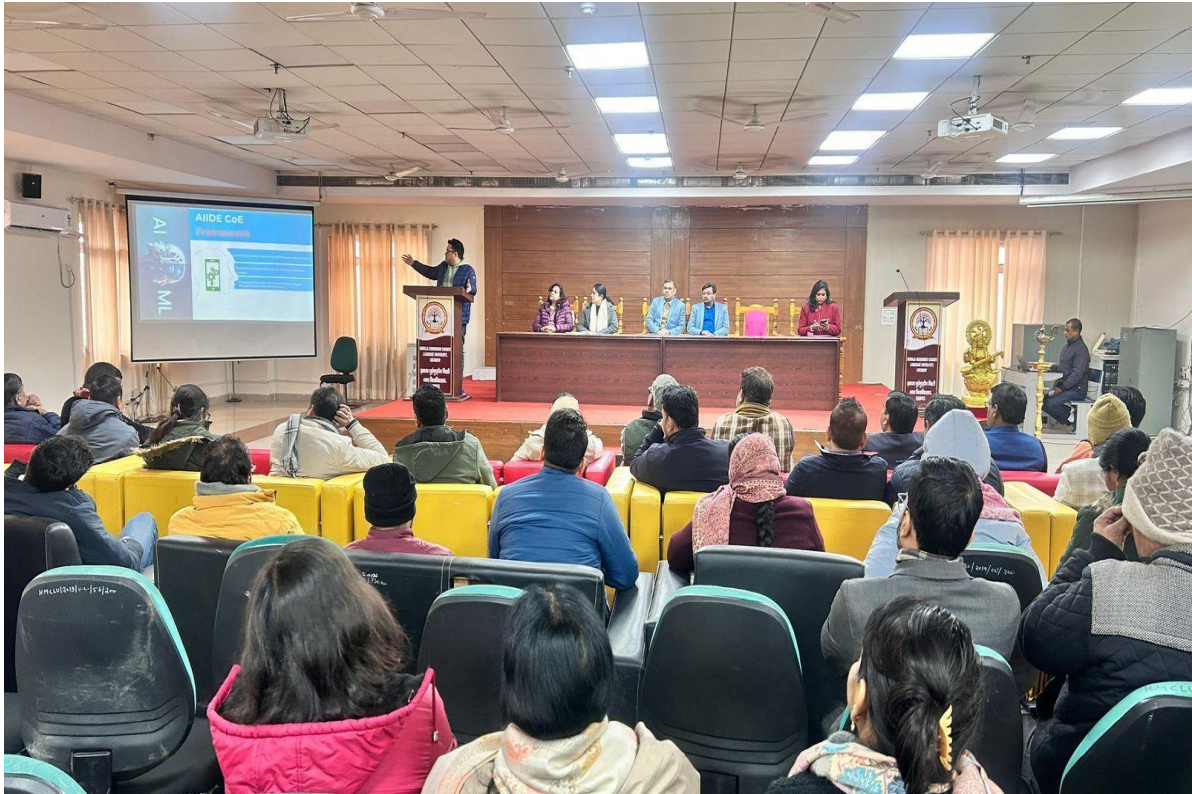
Expert Session on 'Building the future: Start- up Support and AI Innovation