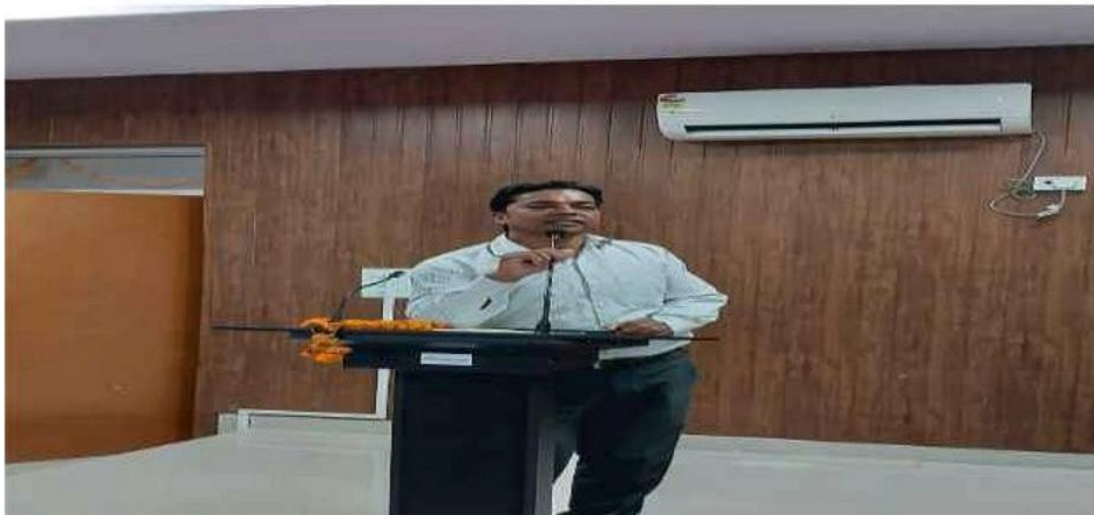
Speech on Women’s Equality Day by a faculty member

The Poster Making Competition hosted by the Department of Biotechnology Engineering on Women’s Equality Day represents a creative shift in the university’s approach to Applied Ethics and Gender Parity . By using visual advocacy as a medium, the event challenged students to translate abstract concepts of “equality” and “rights” into tangible social messages, effectively training them to become “change makers” in their personal and professional spheres. The discourse provided by the faculty moved beyond simple celebration to emphasize that gender balance is a functional necessity for a just society.