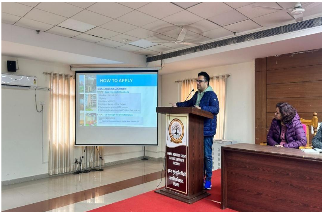
Expert Session on ‘Building the future: Start- up Support and AI Innovation

The expert session on "Start-up Support and AI Innovation," organized in collaboration with IIT Kanpur, underscores the university’s commitment to Entrepreneurial and Technological Ethics. By framing AI and machine learning as tools to solve "real societal problems" in sectors like healthcare and governance, the training shifts the focus from purely commercial gain to socially responsible innovation . The session highlights that an ethical start-up culture is built on the "meaningful application of technology" and an authentic understanding of local needs. By providing budding entrepreneurs with guidance on legal support and validation, the university ensures that innovation-driven growth is conducted with institutional integrity, preparing students to lead ventures that are as ethically grounded as they are technologically advanced.