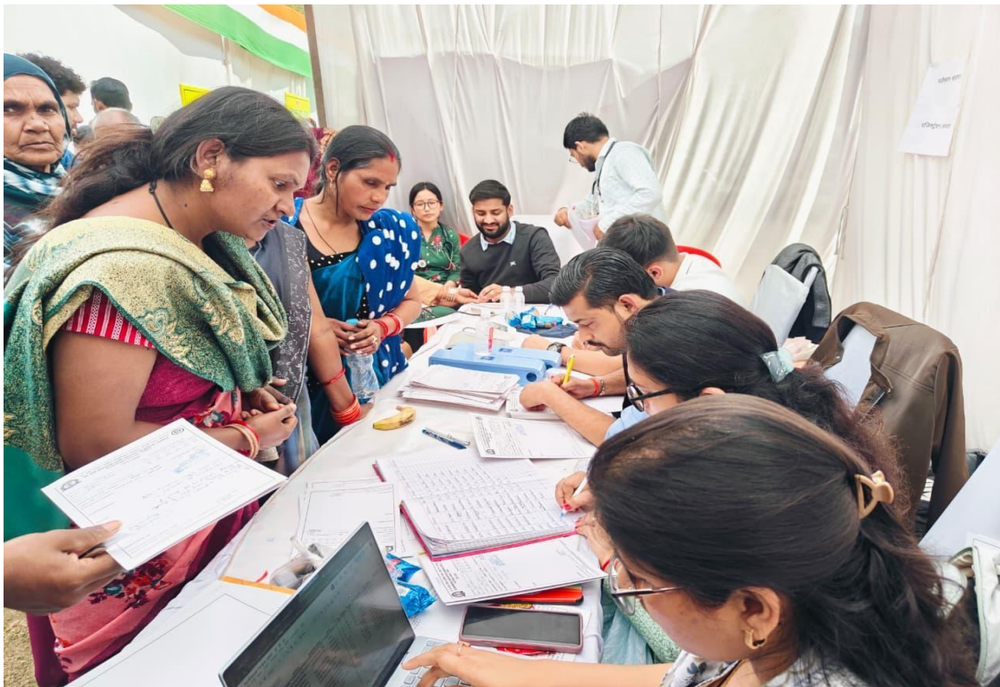
Registration at the Free Health Check-up Camp

The Free Health Check-up Camp organized for residents of the university's adopted villages on February 8, 2026, exemplifies the Ethics of Care and Social Responsibility by bridging the gap between institutional resources and rural healthcare disparities. By facilitating voluntary access to professional medical consultations and free medicine for fifty villagers, the university translates the abstract "right to health" into a functional reality for underserved populations. This initiative reflects a deep-seated Public Health Ethics framework , where the university identifies its role not merely as an academic center, but as a moral steward of community welfare. By eliminating financial and logistical barriers to essential screenings and medicines, the program institutionalizes a model of "health equity," demonstrating that the university's commitment to human dignity and social justice extends directly to the most vulnerable members of society.