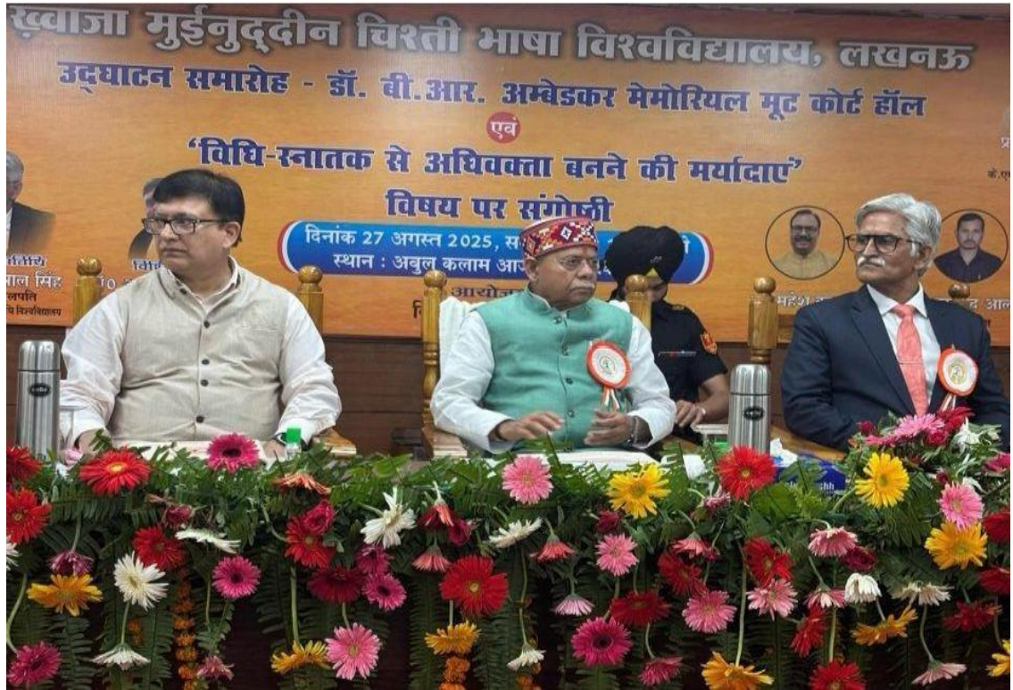
Glimpse of Hon'ble Vice Chancellor with Chief Guest of the Seminar