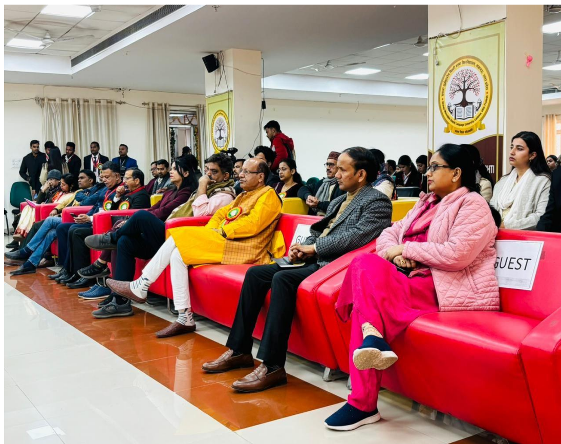
Glimpse of Inaugural Session of the International Seminar

The international seminar “From Margins to Mainstream: The Journey of Third Gender in India”, held on February 5-6, 2026, stands as a premier example of the university’s commitment to Inclusion and Social Justice Ethics . By moving beyond academic theory to address the "constitutional obligation and moral imperative" of transgender rights, the Faculty of Legal Studies facilitated a profound ethical dialogue on human dignity. The seminar challenged rigid social binaries and highlighted that true equality is not merely a legal status but a requirement of "social acceptance" and "right to be seen." By bringing together activists, legal scholars, and spiritual leaders to sensitize over 185 participants, the university demonstrated its role in bridging structural gaps in healthcare, law, and social welfare. This initiative underscores a holistic organizational culture where the protection of marginalized identities is treated as a fundamental ethical duty, ensuring that every member of the university—from students to faculty—is trained to uphold the inherent dignity of all human beings regardless of gender identity.