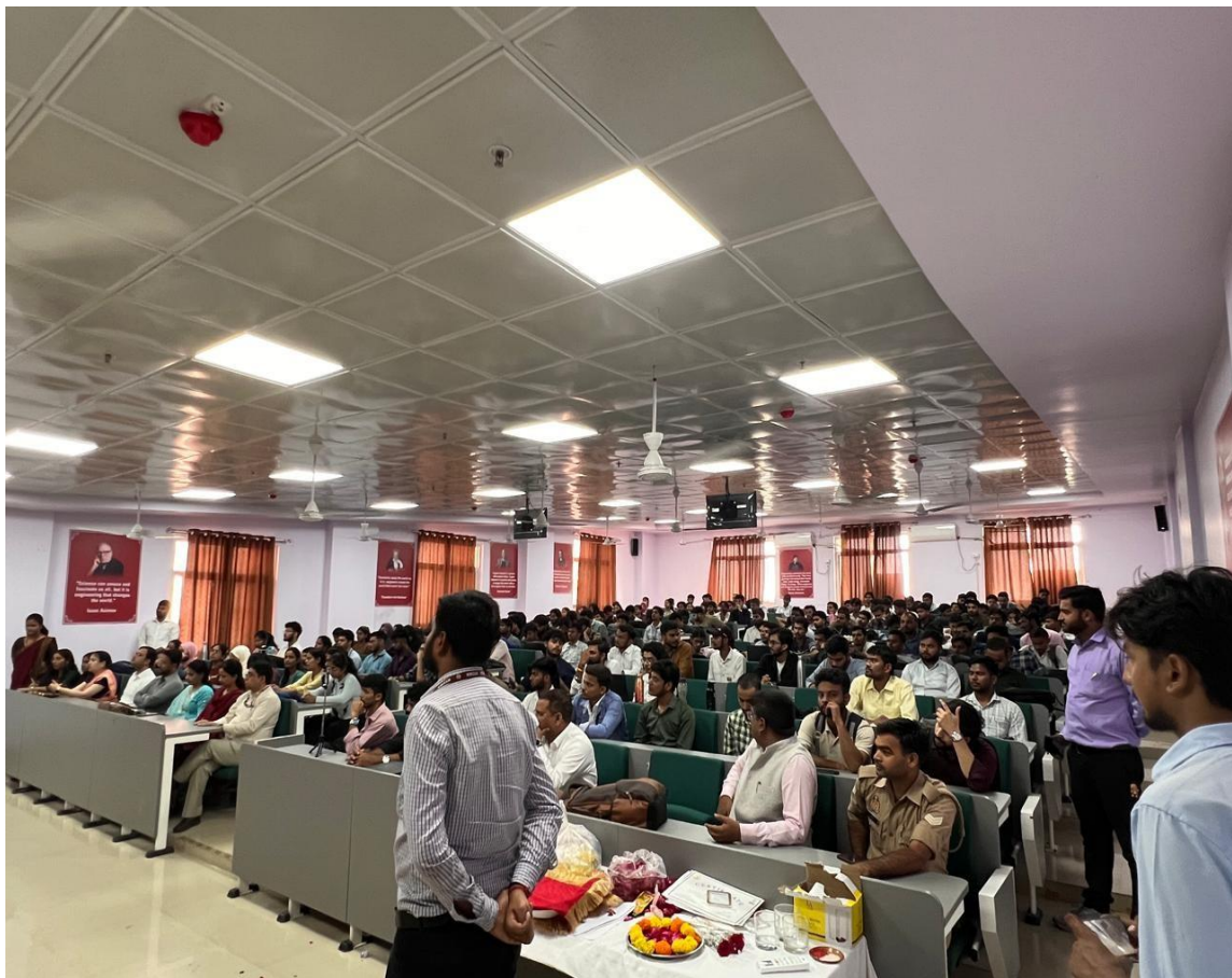
Participants in workshop on ‘Cyber Jagrukta Diwas’

The Workshop on “Cyber Jagrukta Diwas,” held on November 1, 2025, serves as a vital training module for Digital and Professional Ethics within the university. By centring the discussion on the "dharma" (duty) of engineers, the program transcends technical skill-building to instil a core moral obligation toward user privacy, data protection, and system integrity. The workshop emphasized that true technological advancement must be rooted in transparency and honesty, advocating for a "Zero Trust Policy" not just as a technical framework, but as an ethical commitment to safeguarding individuals in a digital society. By linking knowledge to nation-building and moral responsibility, the university demonstrates its holistic approach to fostering an organizational culture where cybersecurity is treated as an essential ethical necessity rather than a mere technical requirement