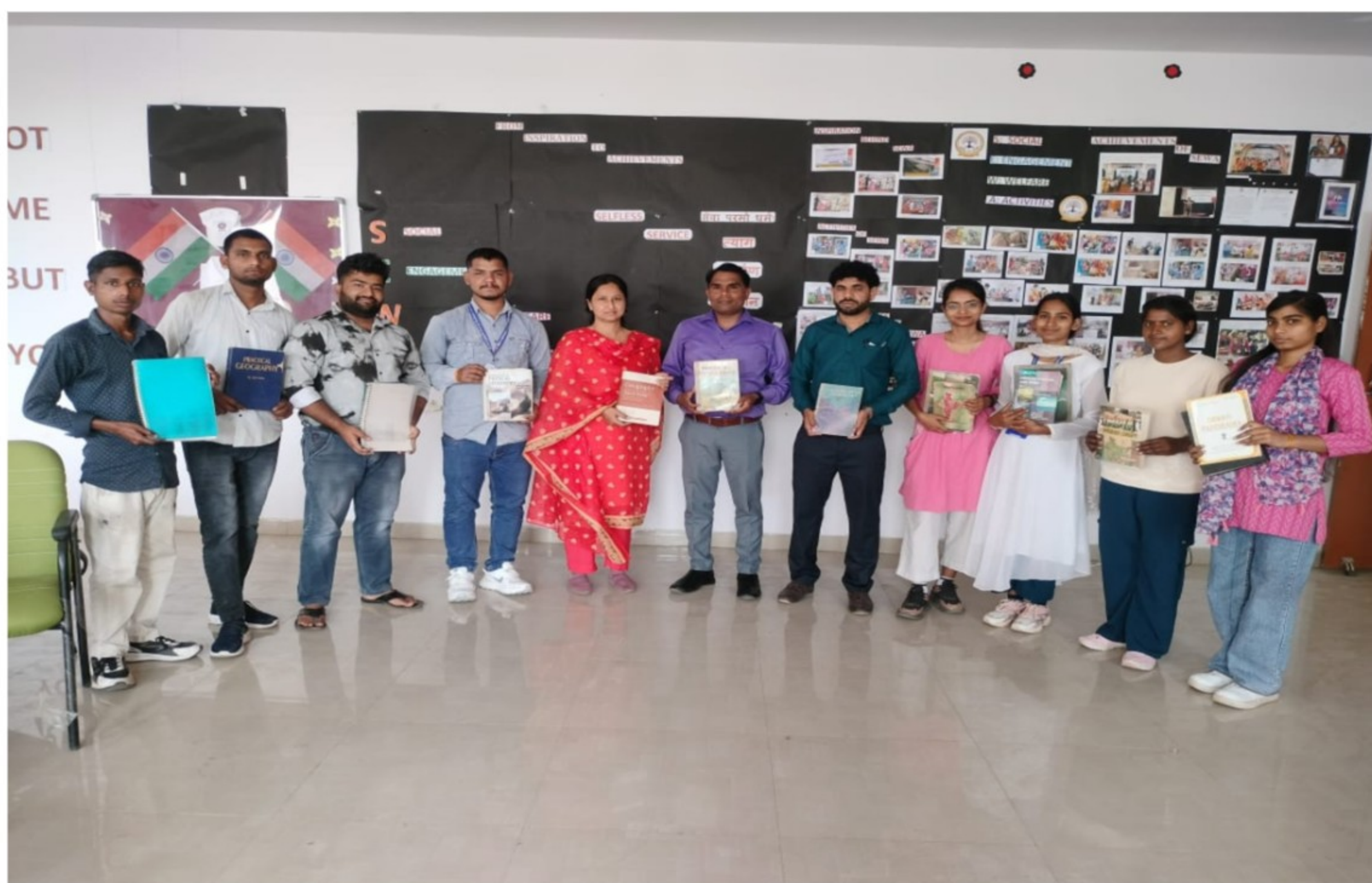
Faculty Convenors along with volunteers

The donated books will be utilized to support educational activities for children in the adopted villages and to encourage a culture of reading and learning within the community.