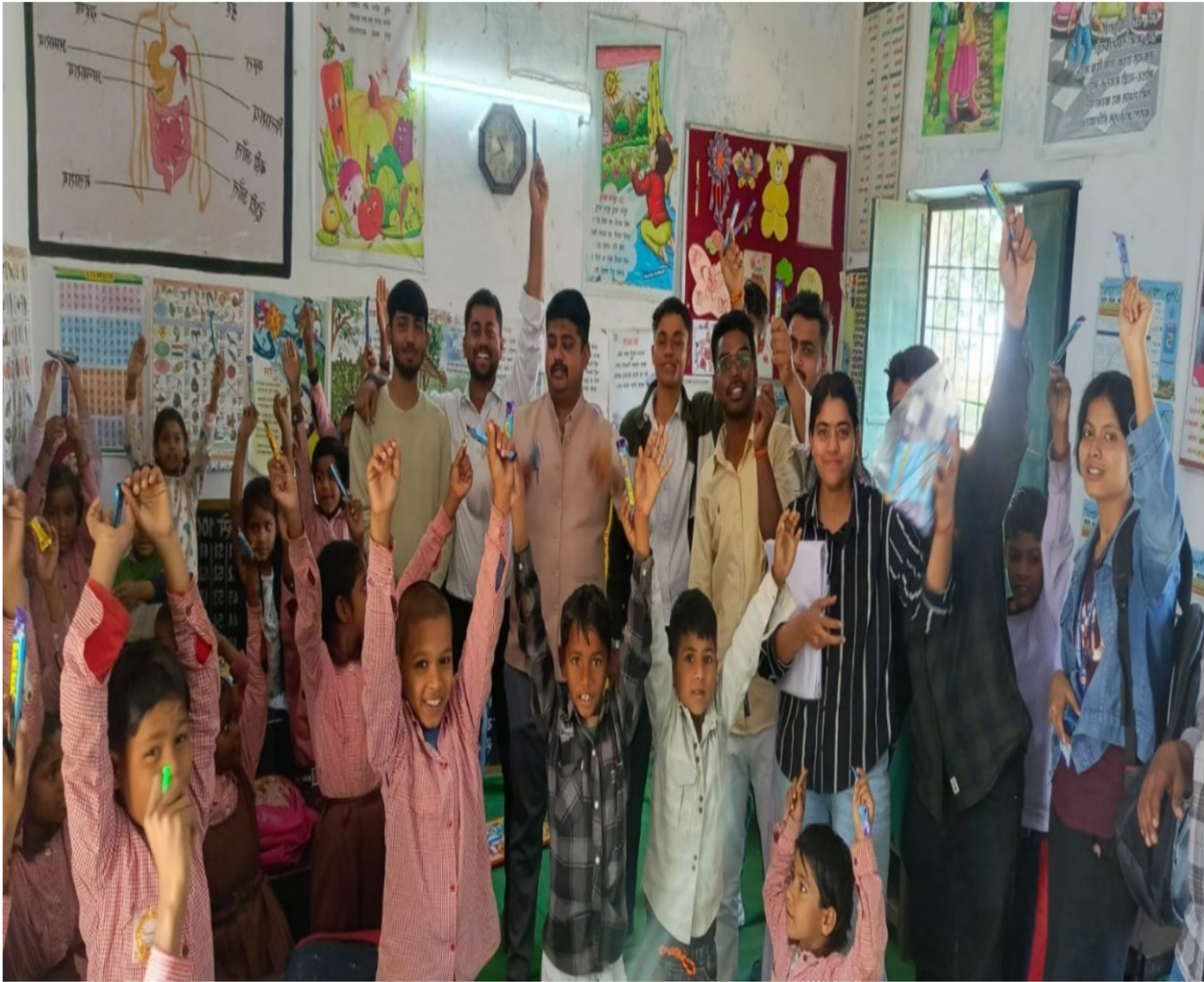
Promoting Awareness among children regarding Sanitation