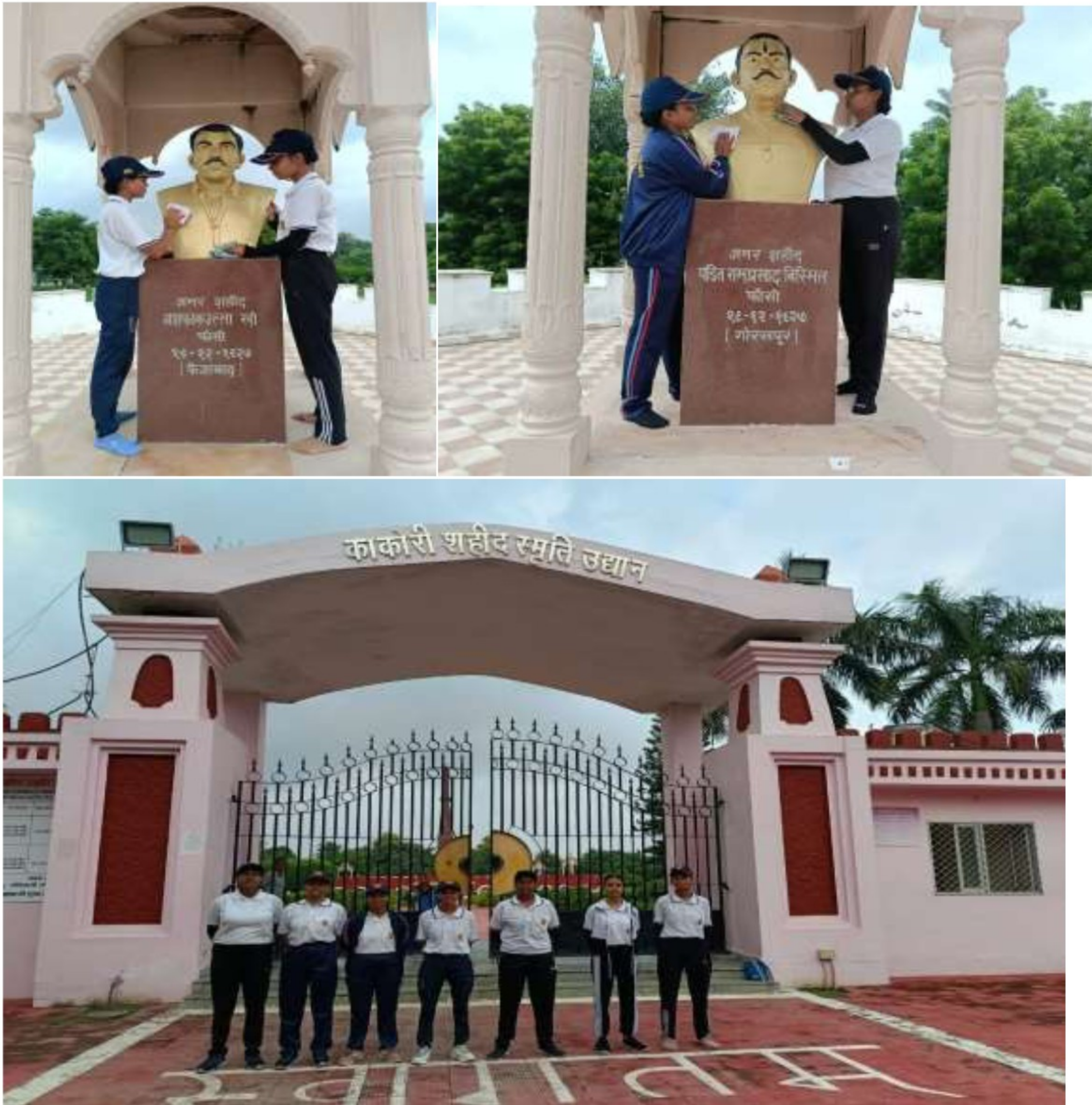
NCC Cadets enthusiastically participating in the Cleanliness Drive

As part of the Swachhta Pakhwada , NCC cadets of the university organized a cleanliness drive on 13 September 2024. The campaign was conducted at Kakori Shaheed Smriti Udyan, where cadets cleaned the statues of freedom fighters and the surrounding areas. Girl cadets actively participated in the initiative. Additionally, a poster-making competition on the theme of cleanliness was organized within the university campus. Through creative posters, cadets conveyed the importance of maintaining cleanliness and environmental responsibility.