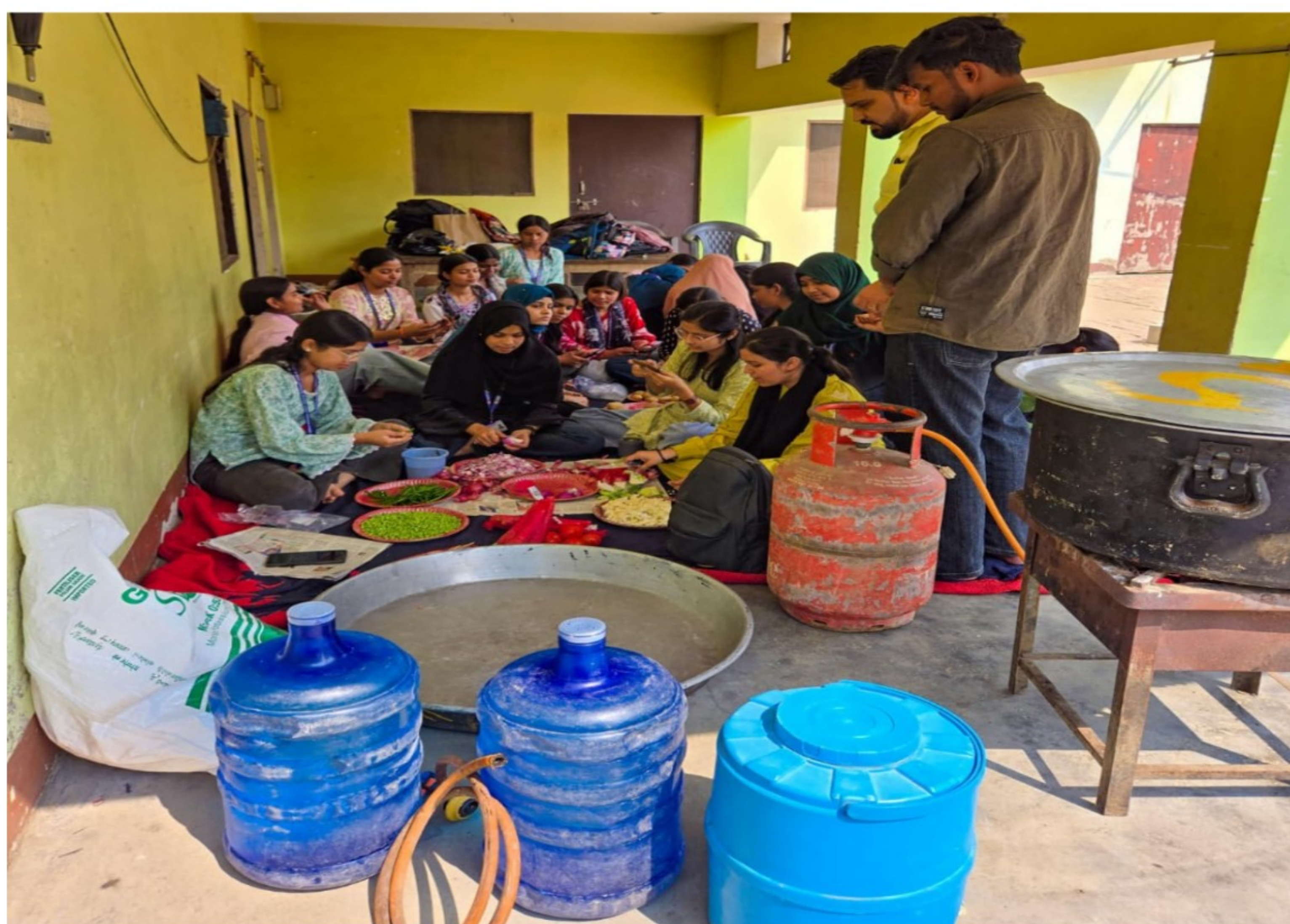
Students preparing food for the community