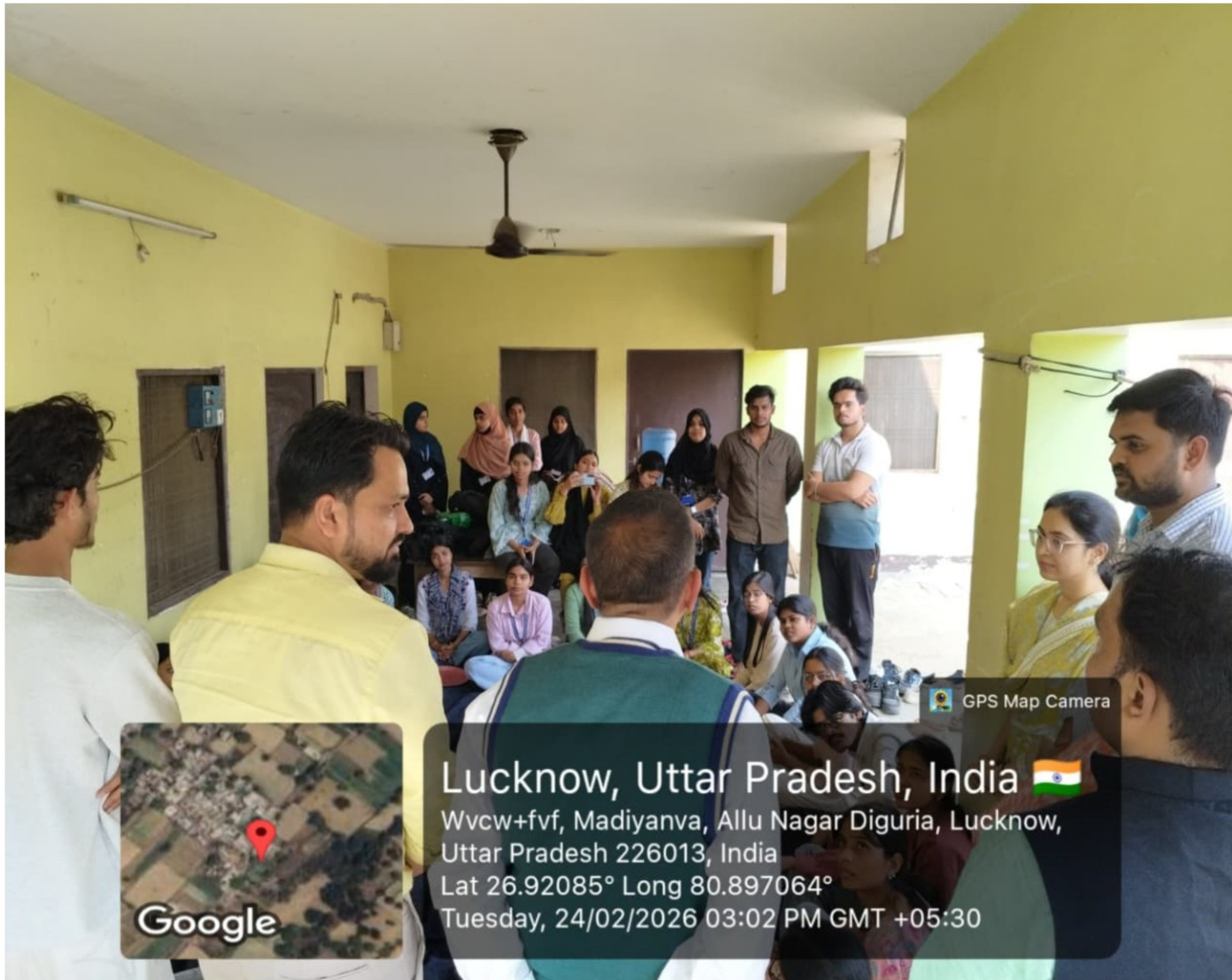
Students sharing food with the community