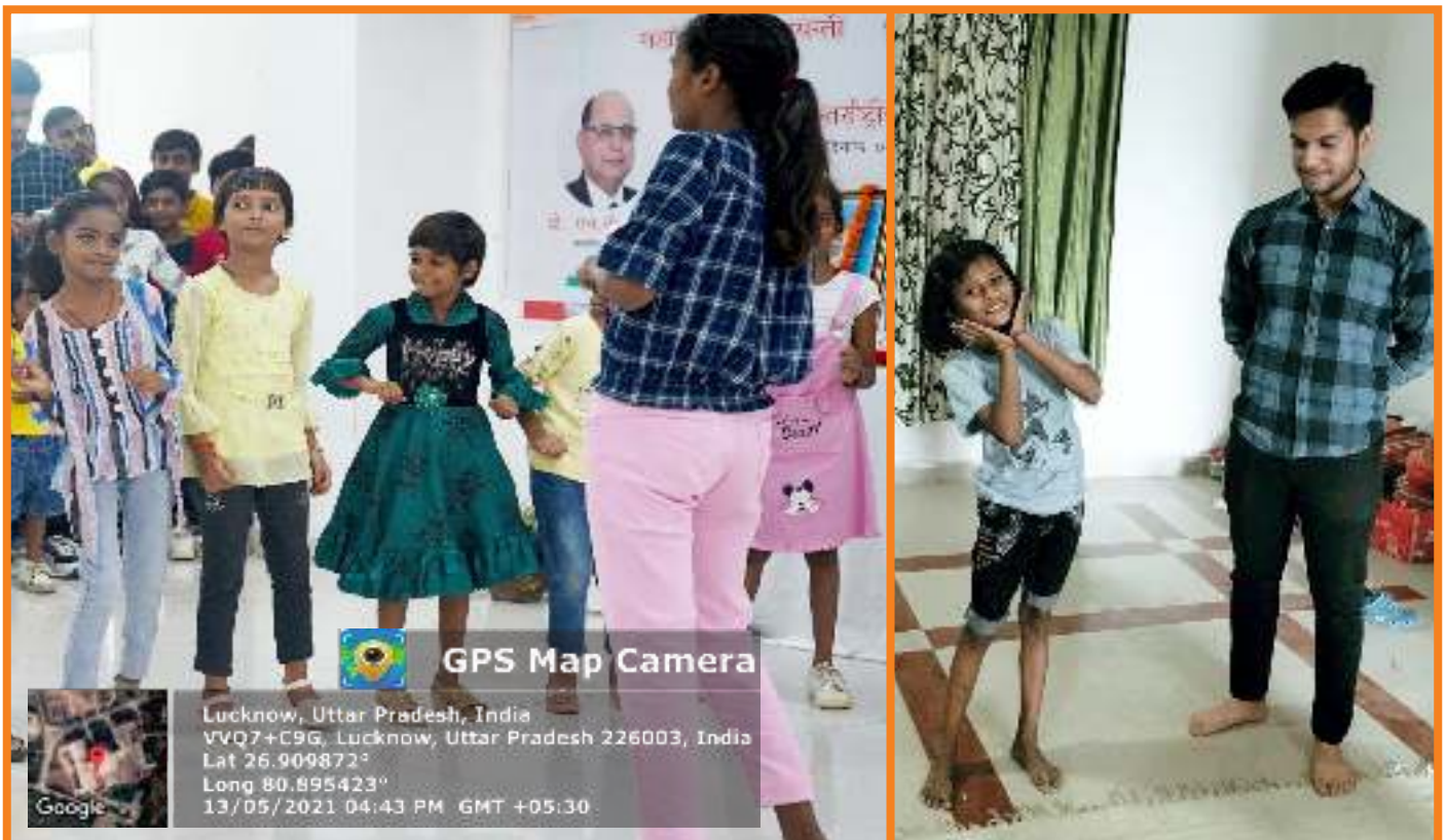
Development of Cultural values in children by involving them in various Cultural activities