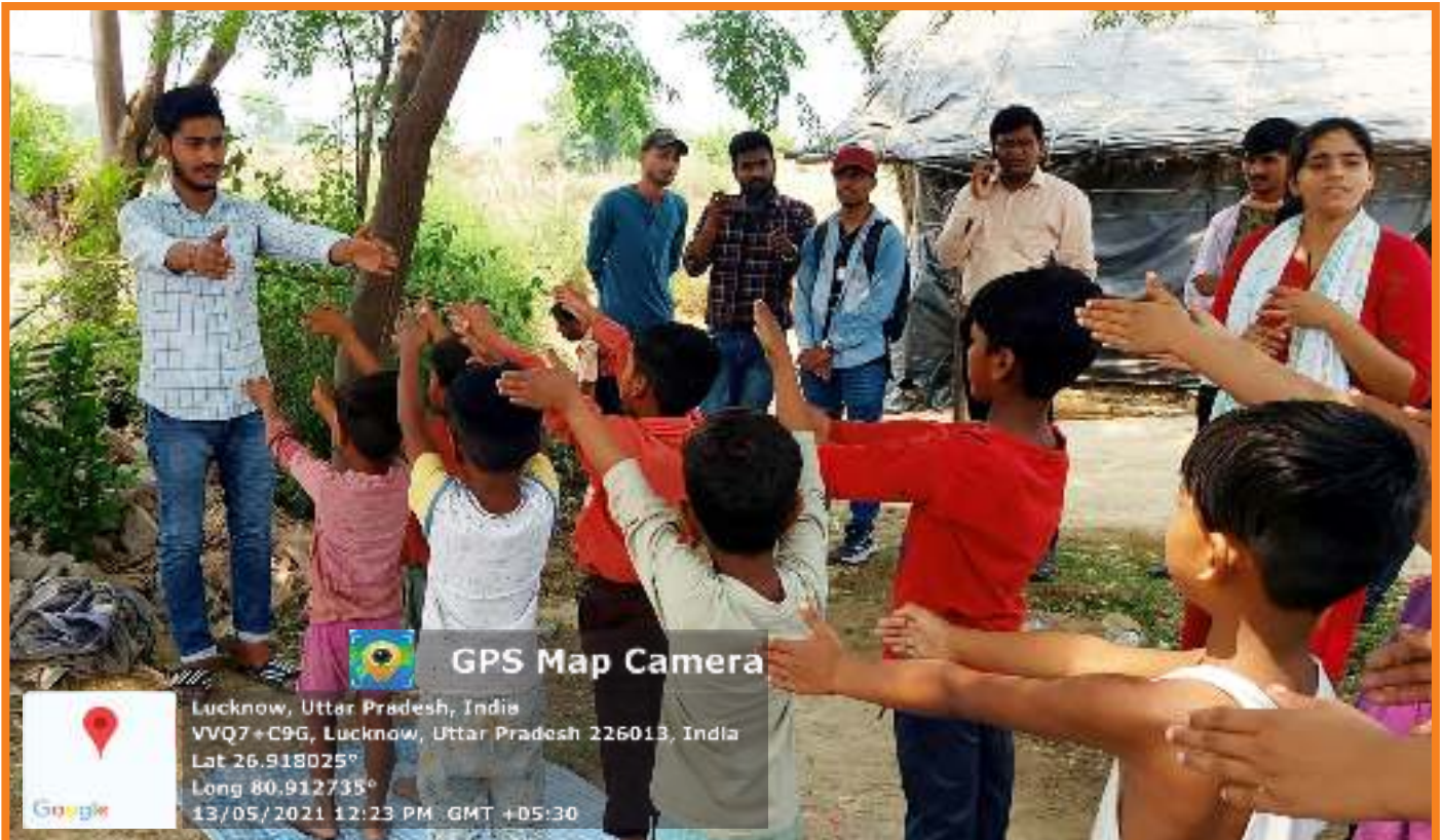
Organization of Yoga session by University volunteers for children of Baal Paathshala in adopted villages