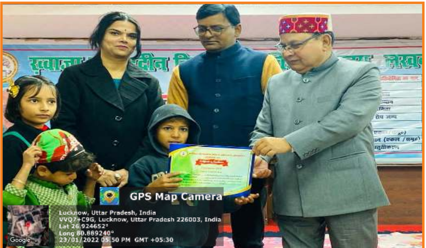
Certificate of Excellence given to children of Baal Paathshala for performance in sports activities organized in the University