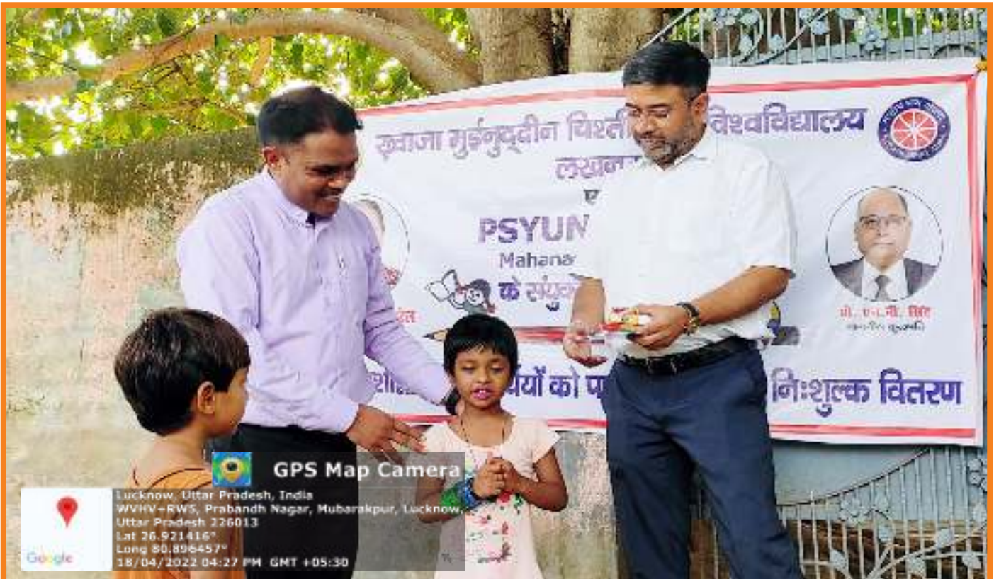
Collaboration of NGO-PSYUNI trust with the University in free distribution of stationary items to Baal Paathshala students in adopted village Lokharia