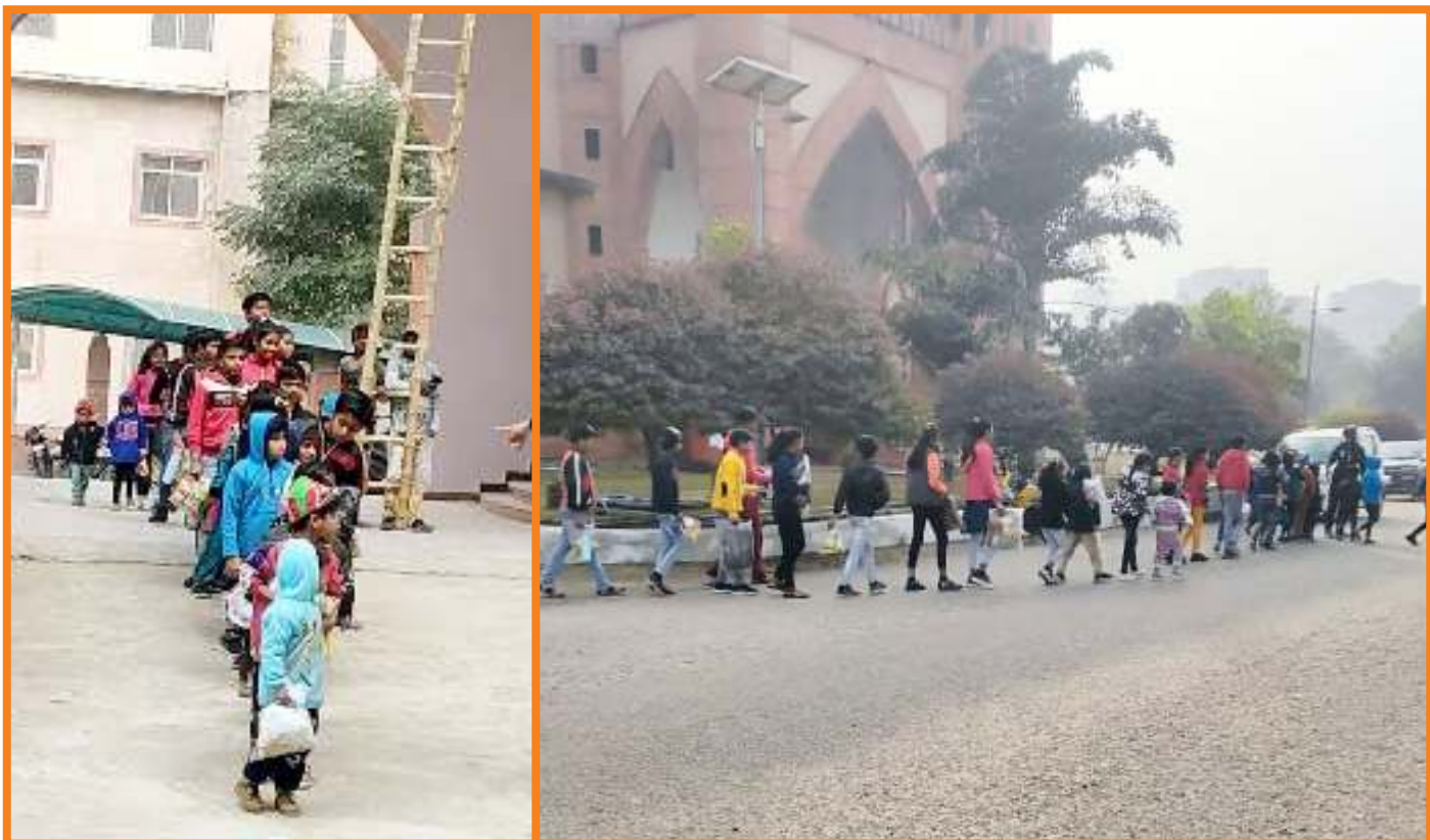
Children from nearby villages leaving the University premises in a disciplined manner after completing their Baal Paathshala classes (2019)