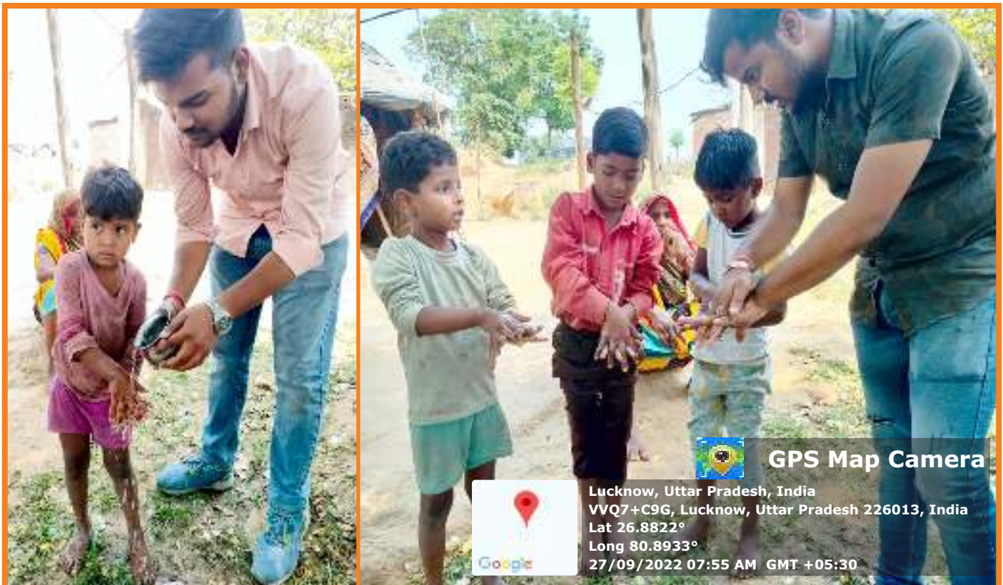
Children of village Lokharia being taught the importance of proper hand washing before taking meals by Volunteers of Baal Paathshaala