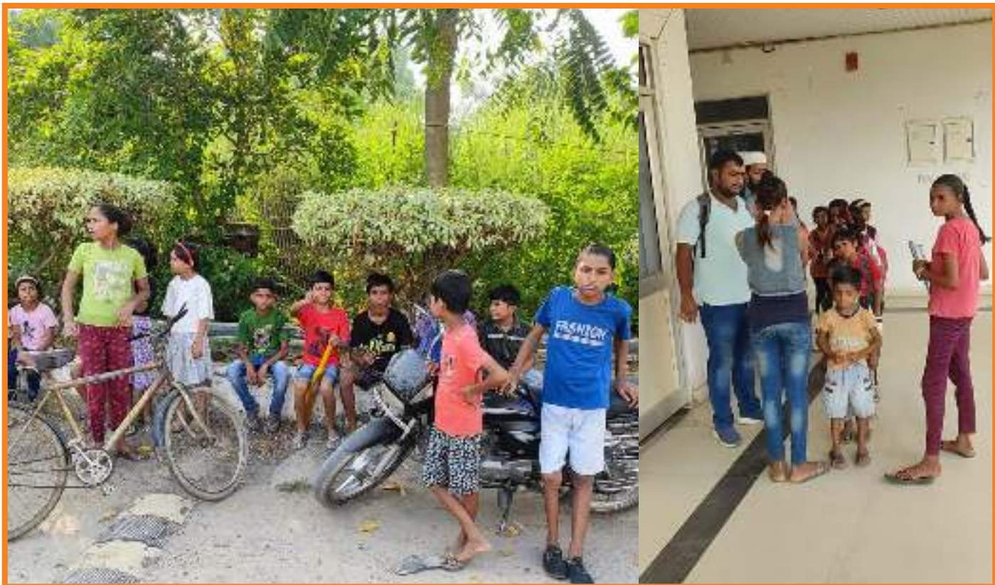
Children from nearby villages coming to the University for attending Baal Paathshala classes (2019)