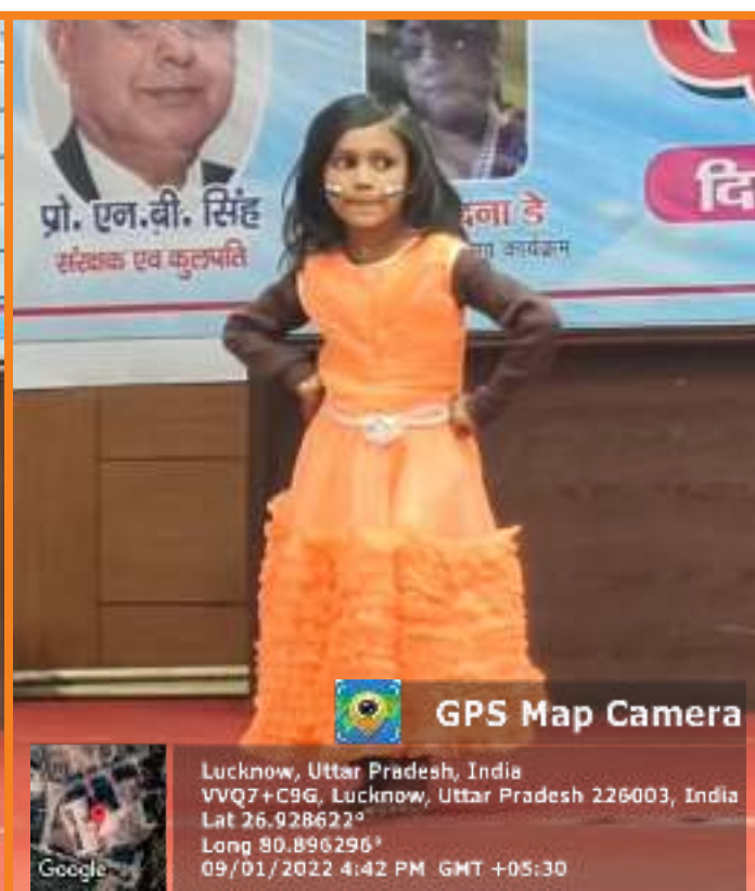
Children of Baal Paathshala during a dance performance Bmisha organized in Dikshotsava of the University