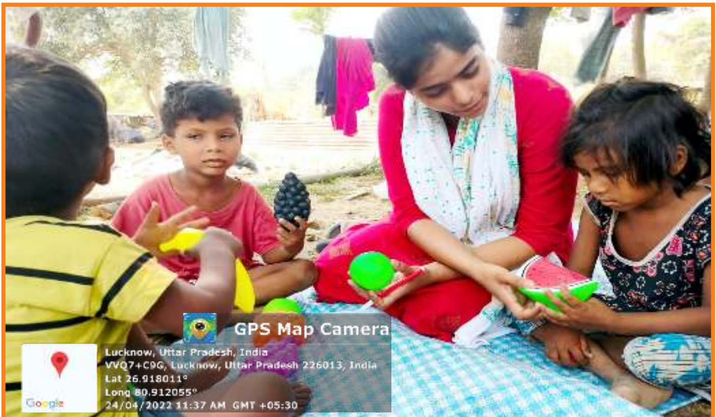
Student Volunteers of Baal Paathshaala discussing the importance of healthy nutrition by using educational toys to the children of adopted village Kakauli