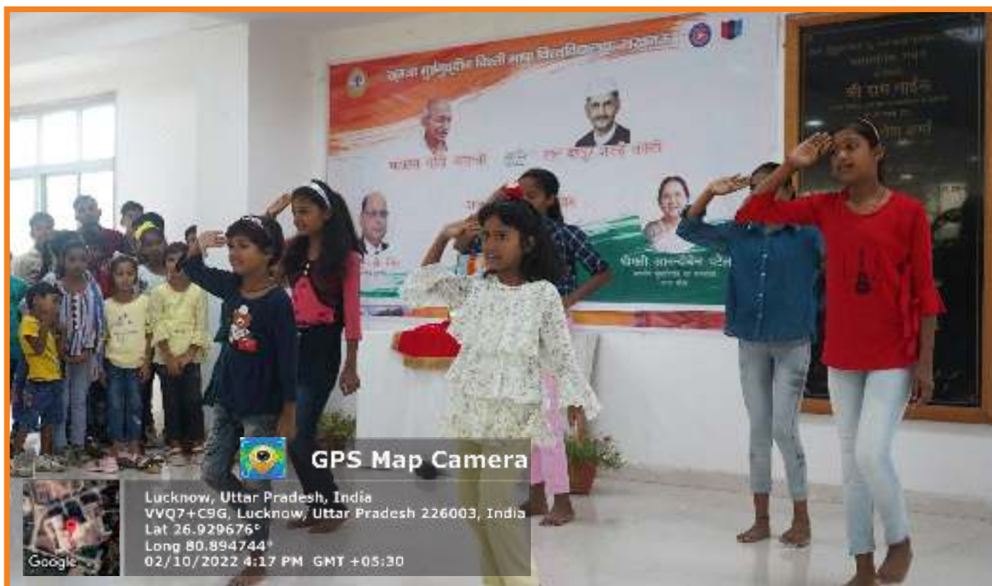
Cultural performance on Mahatma Gandhi Jayanti by children of Baal Paathshala under the guidance of Volunteers