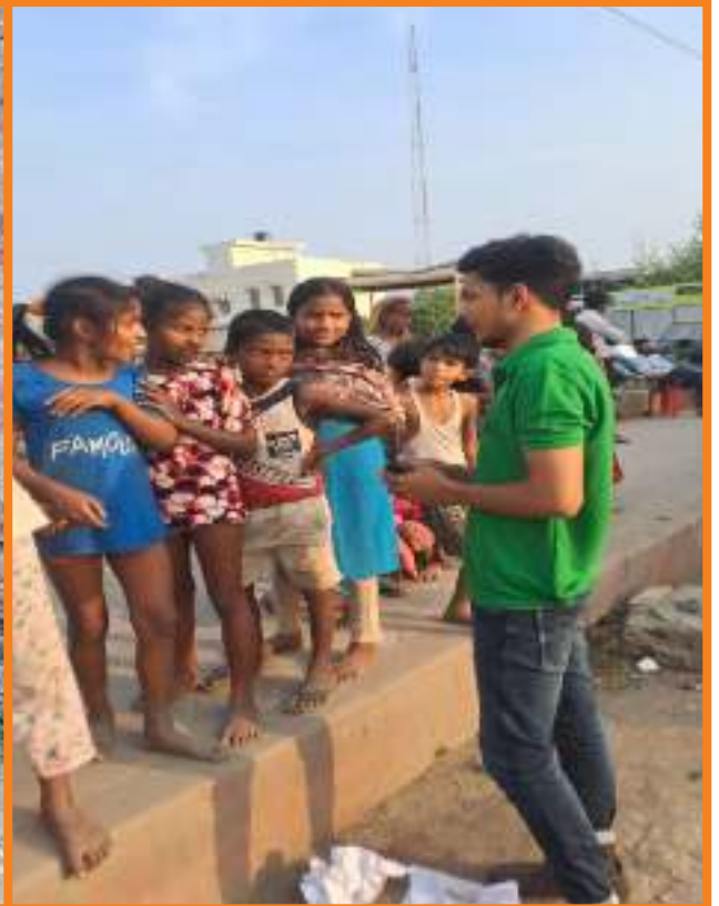
Students conducting survey in nearby villages to encourage children to attend Baal Paathshala (2019)