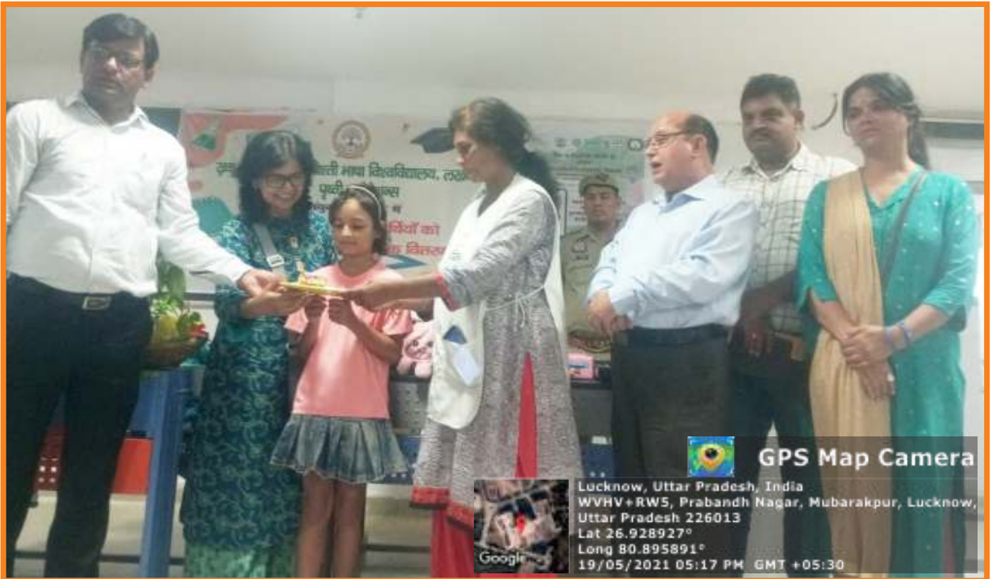
Free distribution of Educational kits to children of Baal Paathshala running in the University campus in collaboration with NGO-Prithvi Innovations