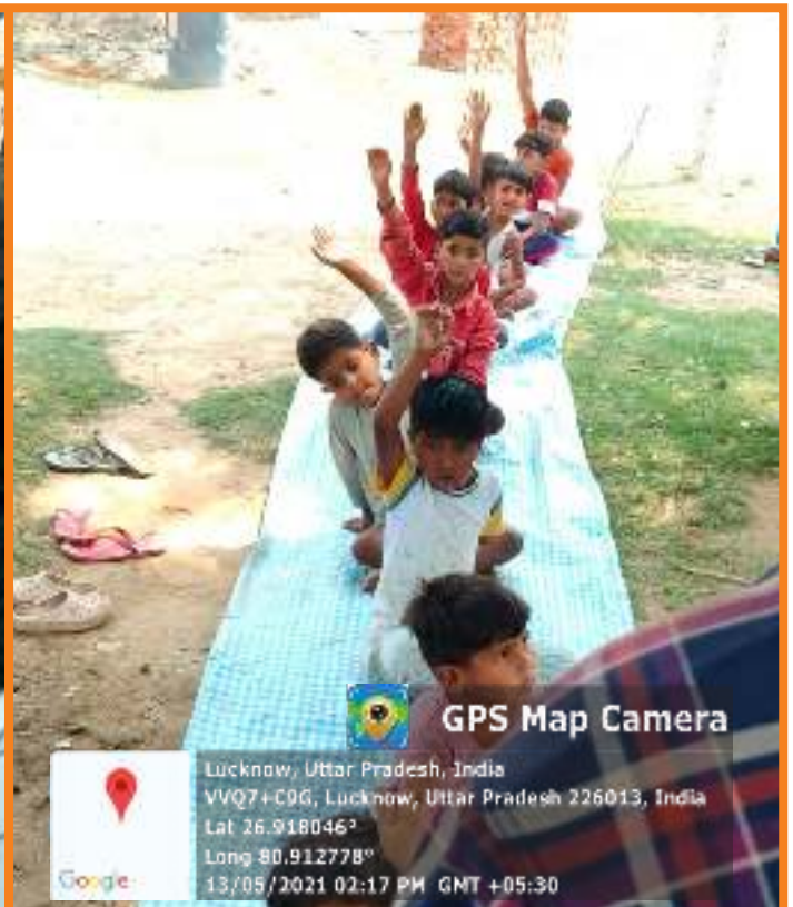
Yoga and Meditation sessions organized for physical development of children in adopted villages