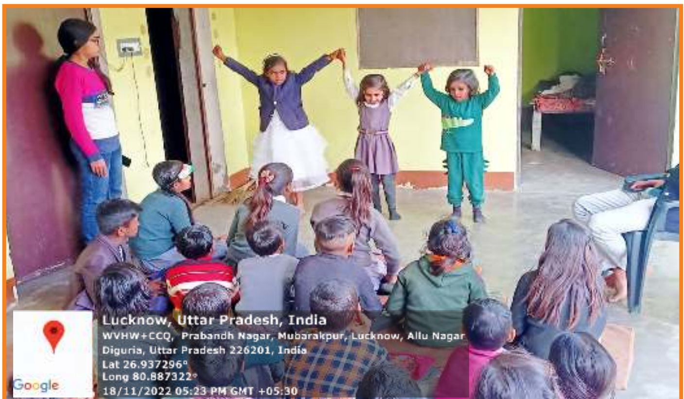
Children from nearby villages performing activities in Baal Paathshaala session of adopted villages