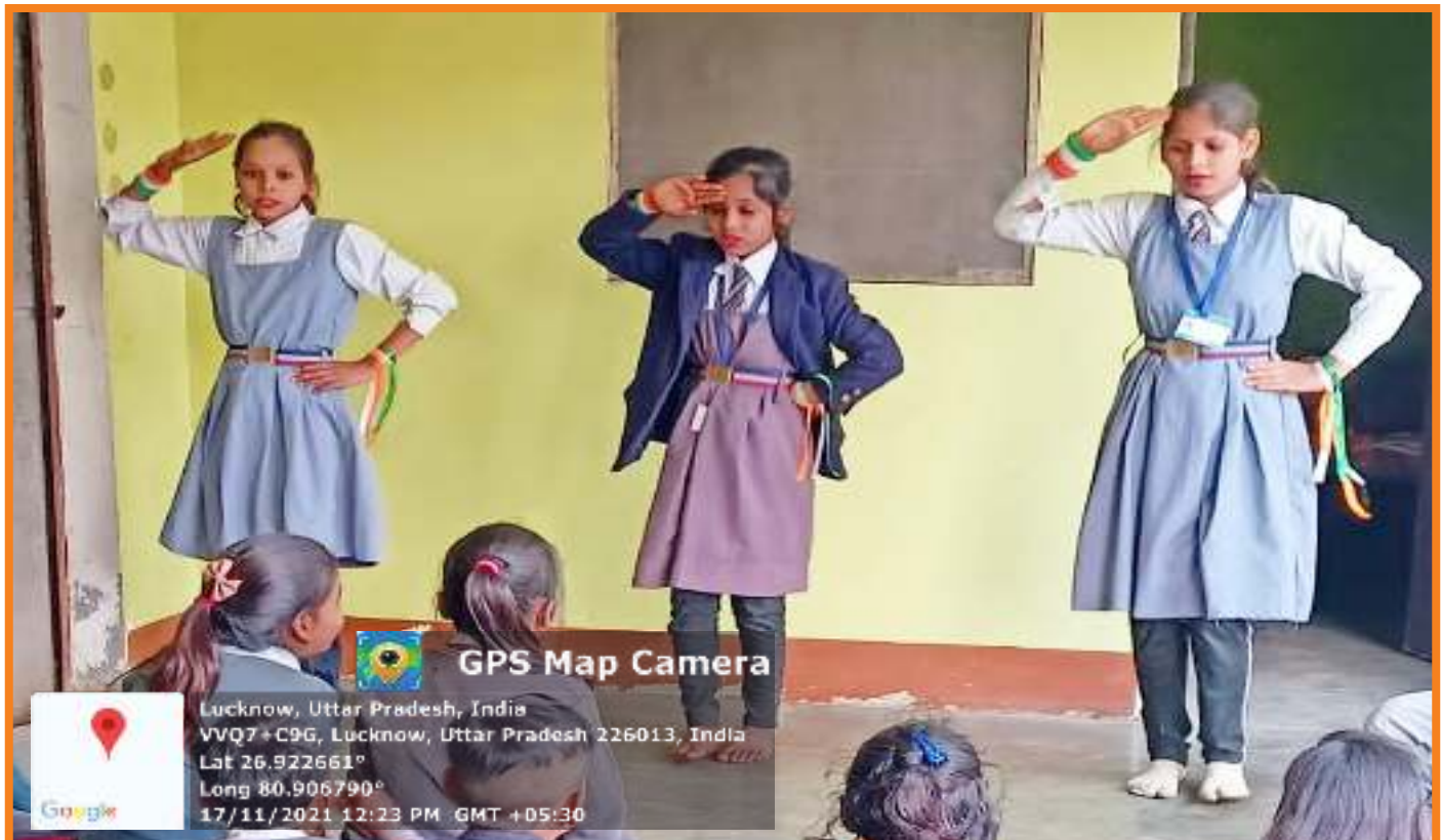
Conduction of Baal Paathshaala by student volunteers in adopted villages