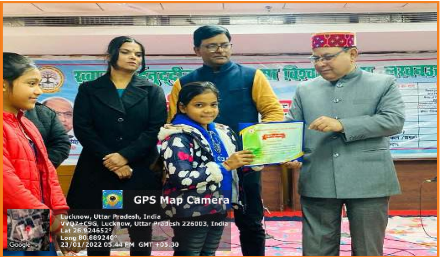
Distribution of Medal and Certificates to children of Baal Paathshala for achievement in sports activities