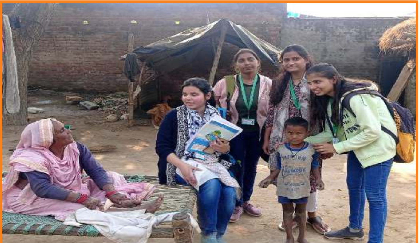
Students encouraging nearby children to attend Baal Paathshala (2019)