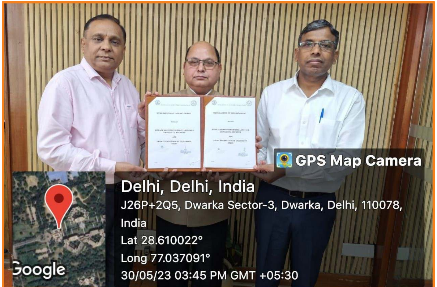
Signing of MoU between Khwaja Moinuddin Chishti Language University and Delhi Technological University, Delhi (30 May 2023)