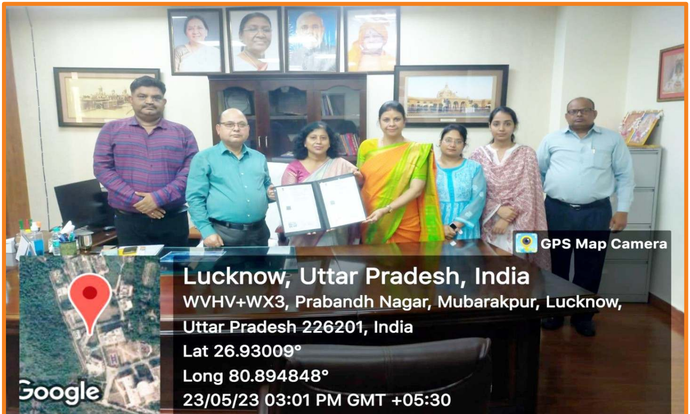
Signing of MoU between Khwaja Moinuddin Chishti Language University and Experiome Biotech Private Limited (23 May 2023)